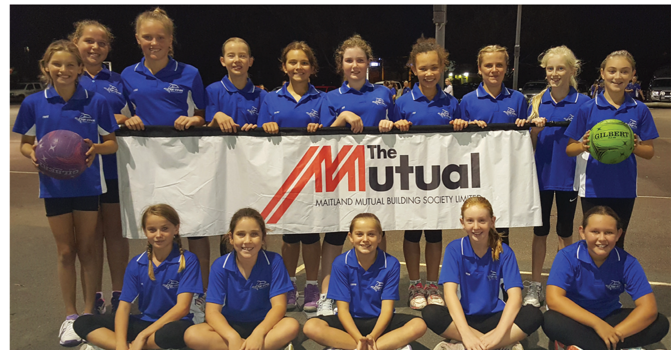
Sponsorship - Port Stephens Under 11's Representative Netball Team