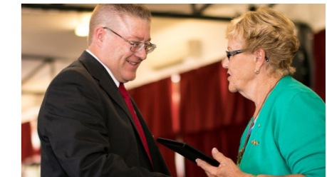
The Mutual Staff - Acknowledgements and Awards