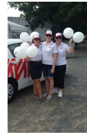
Australia Day Celebrations 2016