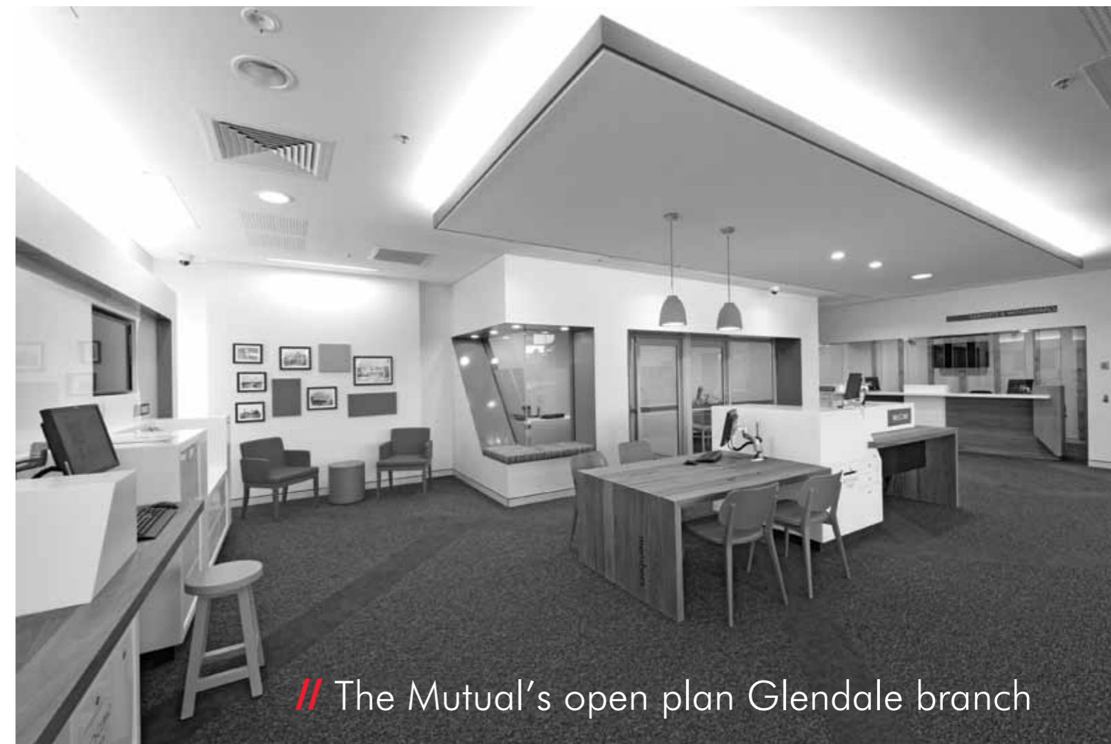
// The Mutual's open plan Glendale branch

The summary statement of cash flows shows that there has been a decrease in cash during the year of $20.2 million, resulting from the purchase of $23.1 million in financial assets.